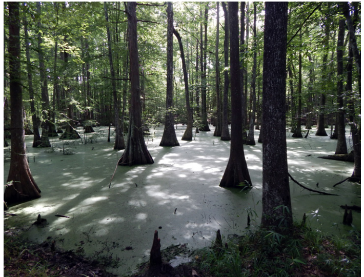
Cypress swamp

fulfills the objectives of the National Park Service Land and Water Conservation Fund (LWCF) for federal funding for outdoor recreation facilities and open space land acquisition, and includes a statewide inventory and evaluation of supply and demand for water and land based activities and outdoor recreation facilities in Louisiana.